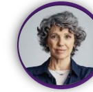
Chantal Pharmacovigilance France