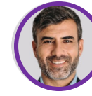
Savvas Epidemiology / RWE Greece