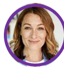
Emma Market Access UK